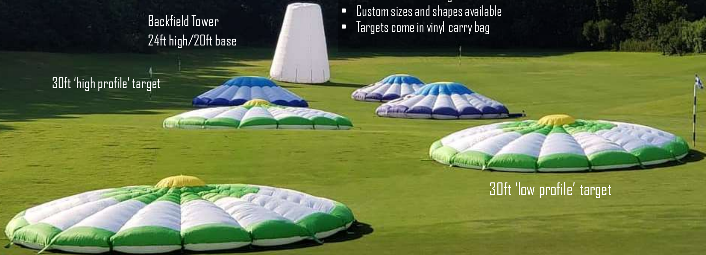
30ft 'low profile' target